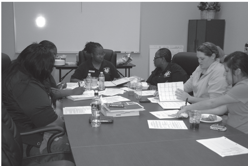
The Student Forum meets at Century City Center and is a great way for students to be involved while they are taking classes at Vernon College.

To graduate with High Honors or Honors at VC, the student must complete an associate degree or a certificate program of at least 30 semester hours. Graduation with High Honors requires a grade point average (GPA) on all college-level work attempted at VC of 4.0 or be in the top ten (10%) percent of the graduation class. Graduation with Honors requires a grade point average (GPA) on all college-level work attempted at VC of at least 3.5 and below the top ten (10%) percent, but within the top twenty-five (25%) percent of the graduation class.