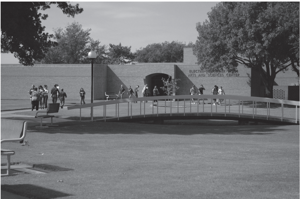
The Vernon campus offers dorms, a student center, and classrooms all within walking distance of each other.